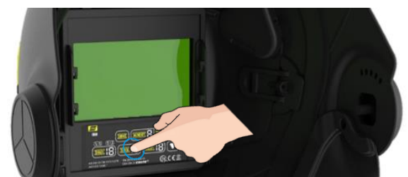
High optical class ADF, with colour touch screen interface