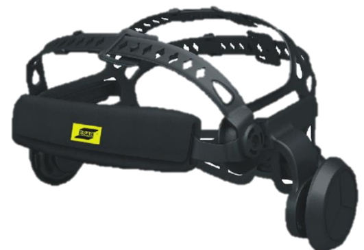
Halo™ comfort 5 point harness (Front view)